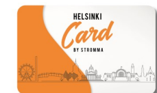
FREE with Helsinki Card

Ateneum Art Museum: Eero Järnefelt until 25.8.2024